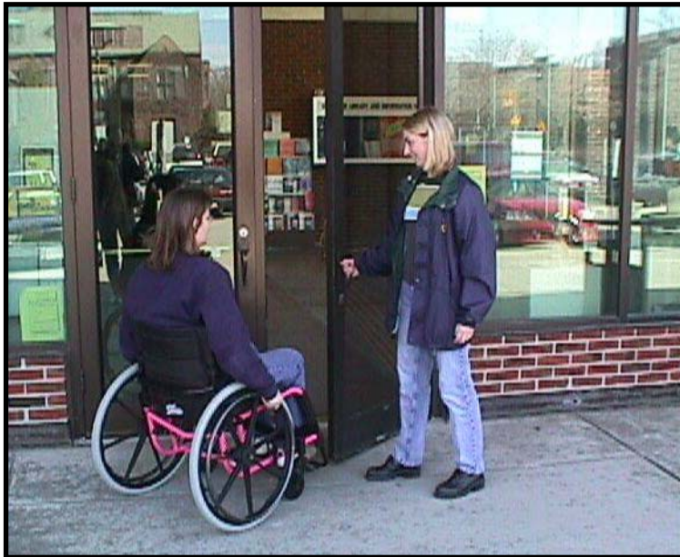
Figure B: Example of Accommodation